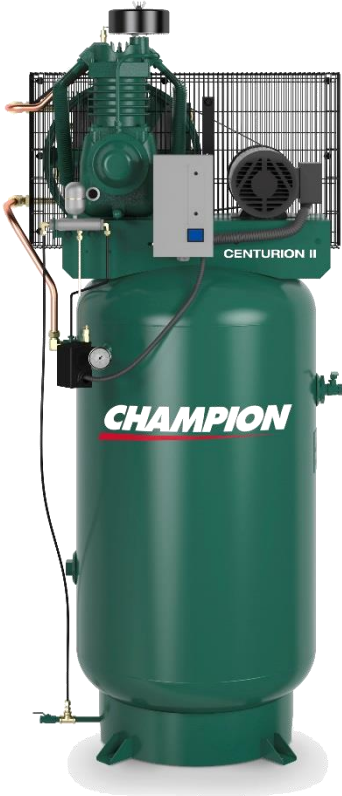
VRV5-8 Shown Above