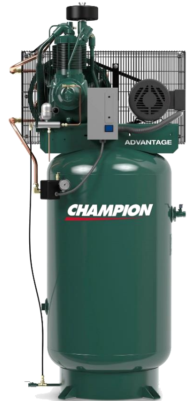
VR5-8 Shown Above